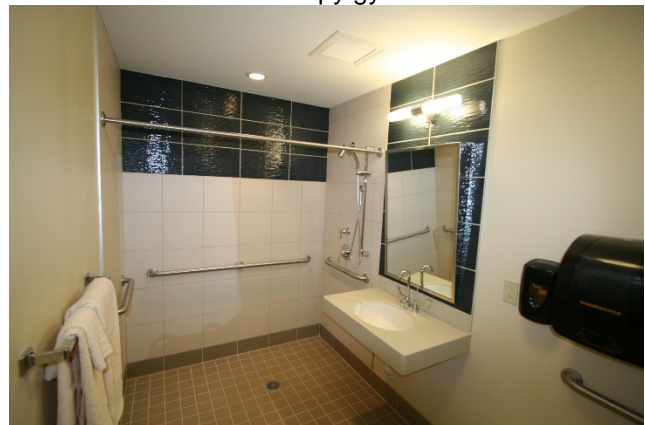
Patient room shower