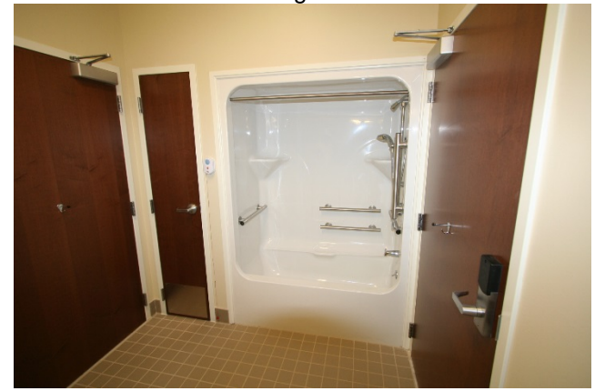
Shower and ADL training bath