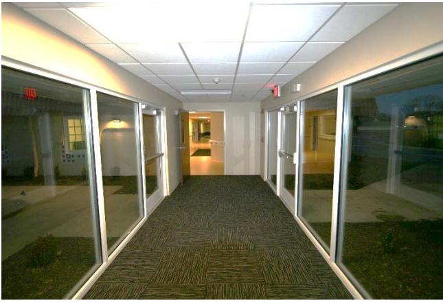
Connection to original facility