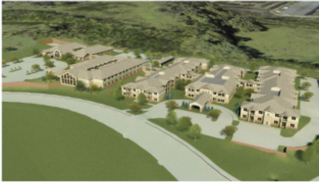
ST. CHARLES SENIOR COMMUNITY, LLC