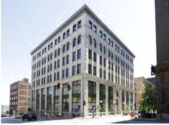
Swofford Lofts @ Roaster's Block

Address: 701 Broadway Boulevard Kansas City, Missouri Description: 56 Apartments + Community Spaces Project type: Historic Renovation & Adaptive Reuse of Warehouse Building Awards: Multifamily Executive Adaptive Reuse Grand Award; Historic KC Foundation Award For Adaptive Reuse Date Completed: 2016