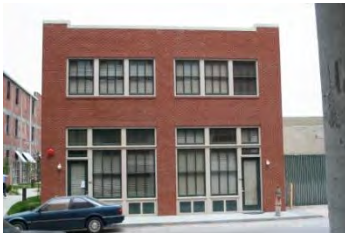
Old Town Lofts Bldg 3

Address: 213 Walnut Street Kansas City, Missouri