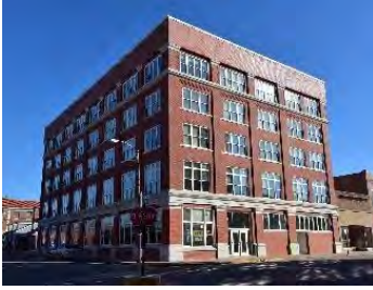
Route 66 Landing Mining & Exchange Bldg

Address: 38 North Main Street Miami, Oklahoma