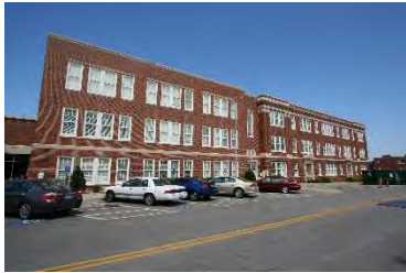
Palmer Place Senior Apartments

Address: 222 North Pleasant Street Independence, Missouri