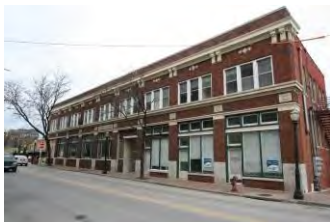
Brown & Loe Building

AKA: Merchants Bank Building Address: 427-29 Walnut Street Kansas City, Missouri