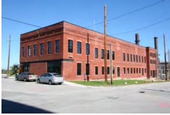
Old Town Lofts Bldg 1

Address: 119 Wyandotte Street Kansas City, Missouri