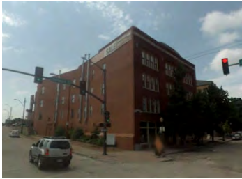
Blackburn Coffee Building

Awards: Historic KC Foundation Preservation Award Date Completed: 1990