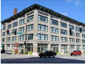
Opera House Lofts

Awards: Cornerstone Award Date Completed: 2000