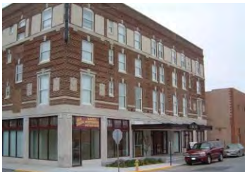
Drake Hotel Apartments

Awards: Cornerstone Award Date Completed: 2006