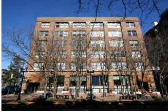
Soho V Lofts

Address: 410 West 8 th Street Kansas City, Missouri