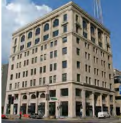
St. Louis Post Dispatch

Address: 1139 Olive Street St. Louis, Missouri Description: Commercial Office Project type: Historic Renovation of Office Building Awards: St. Louis Missouri Landmarks Association Honor Award; St. Louis Assoc. of General Contractors Construction Keystone Project of The Year Award < $5M; Preserve Missouri Award Date Completed: 2004