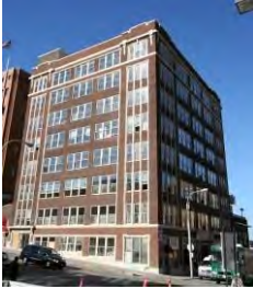
Graphic Arts Building

Address: 934 Wyandotte Street Kansas City, Missouri