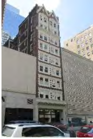
New Yorker Lofts

Address: 1114 Baltimore Kansas City, Missouri