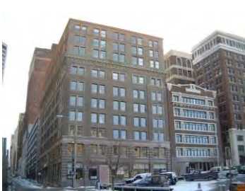
Library Lofts East

Aka: Dwight & Burnap Buildings Address: 1004 Baltimore Avenue Kansas City, Missouri