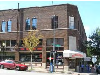
Gillis Opera House

Address: 504-506-508 Walnut Street Kansas City, Missouri