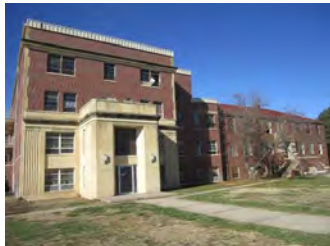
St. Thomas Historic Residences

Address: 210 South Range Avenue Colby, Kansas