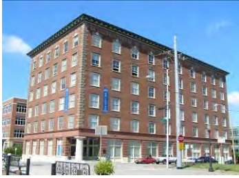
Richards & Conover Lofts

Address: 200 West 5th Street Kansas City, Missouri