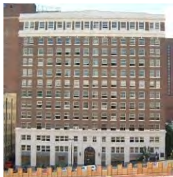
Library Lofts West

Address: 127 West 10th Street Kansas City, Missouri Description: 168 Apartments, Club room, Fitness, Pool Project type: Historic Renovation & Adaptive Reuse of Office Building