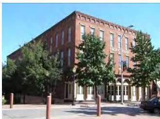
Pacific House Hotel

Address: 401 Delaware Street Kansas City, Missouri