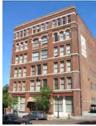
Askew Saddlery Lofts

Address: 213 Delaware Street Kansas City, Missouri