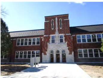
Grant Historic Residences

Address: 520 West 12th St Goodland, Kansas