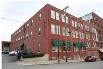
Volker Place Lofts

Address: 6 West Third Street Kansas City, Missouri