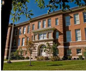
D.A. Holmes Senior Apts.

Awards: Preserve Missouri Award Date Completed: 2005