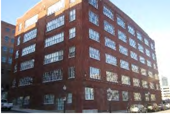
Boss Lofts @ Roaster's Block

Address: 701 Broadway Boulevard Kansas City, Missouri Description: 56 Apartments + Community Spaces Project type: Historic Renovation & Adaptive Reuse of Warehouse Building Awards: Multifamily Executive Adaptive Reuse Grand Award; Historic KC Foundation Award For Adaptive Reuse Date Completed: 2016