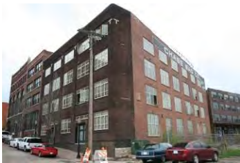
Chase Bag Company

Awards: Cornerstone Award Date Completed: 2000