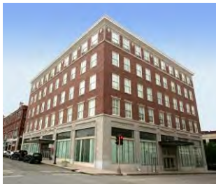
Townsend & Wall

Address: 6th & Francis Streets St. Joseph, Missouri