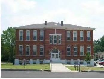
Eugene Field Apartments

Address: 403 Glendale Street Park Hills, Missouri