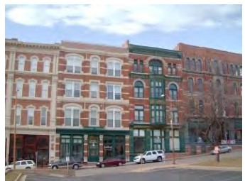
Fourth Street Lofts

Address: 216 North 4th Street St. Joseph, Missouri