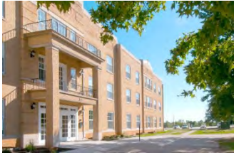
Enid Senior Residences

Address: 311 Lakeview Drive Enid, Oklahoma