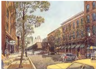
Market Square City Market

Awards: Historic KC Foundation Preservation Award Date Completed: 1990