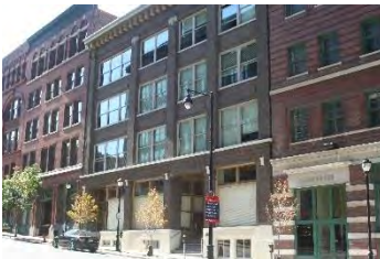
Butler Brothers Lofts

Address: 525 East Armour Boulevard Kansas City, Missouri Description: 104 Apartments + Community Spaces Project type: Historic Renovation of Apartment Building Date Completed: 2016