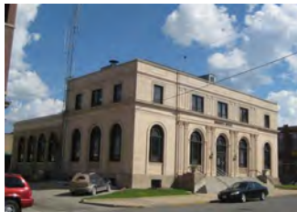
Pettis County Safety Bldg

Address: 319 South Lamine Street Sedalia, Missouri