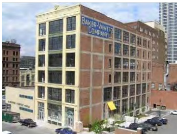
LOFTS @ 917

Address: 917 Wyandotte Street Kansas City, Missouri