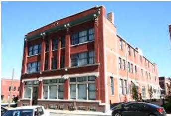
Old Town Lofts Bldg 2

Address: 207 Walnut Street Kansas City, Missouri