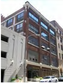
Gas Light Lofts

Awards: Cornerstone Award Date Completed: 1999