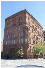
New England Lofts

Address: 112 West 9 th Street Kansas City, Missouri