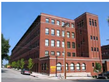
Lofts at Lafayette Square

Awards: Cornerstone Award Date Completed: 2003