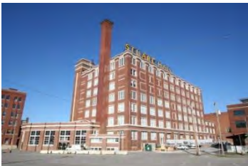
Freight House Lofts

Address: 2121 Central Street Kansas City, Missouri