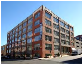
Burd & Fletcher Lofts

Address: 321 West 7th Street Kansas City, Missouri