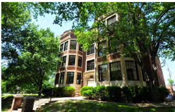
Armour Park Apartments

Address: 608 East Armour Boulevard. Kansas City, Missouri