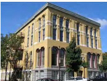
Board of Trade Building

Address: 502 Delaware Street Kansas City, Missouri