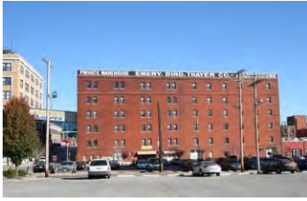
Emery, Bird, & Thayer Lofts

Address: 1601 Walnut Street Kansas City, Missouri